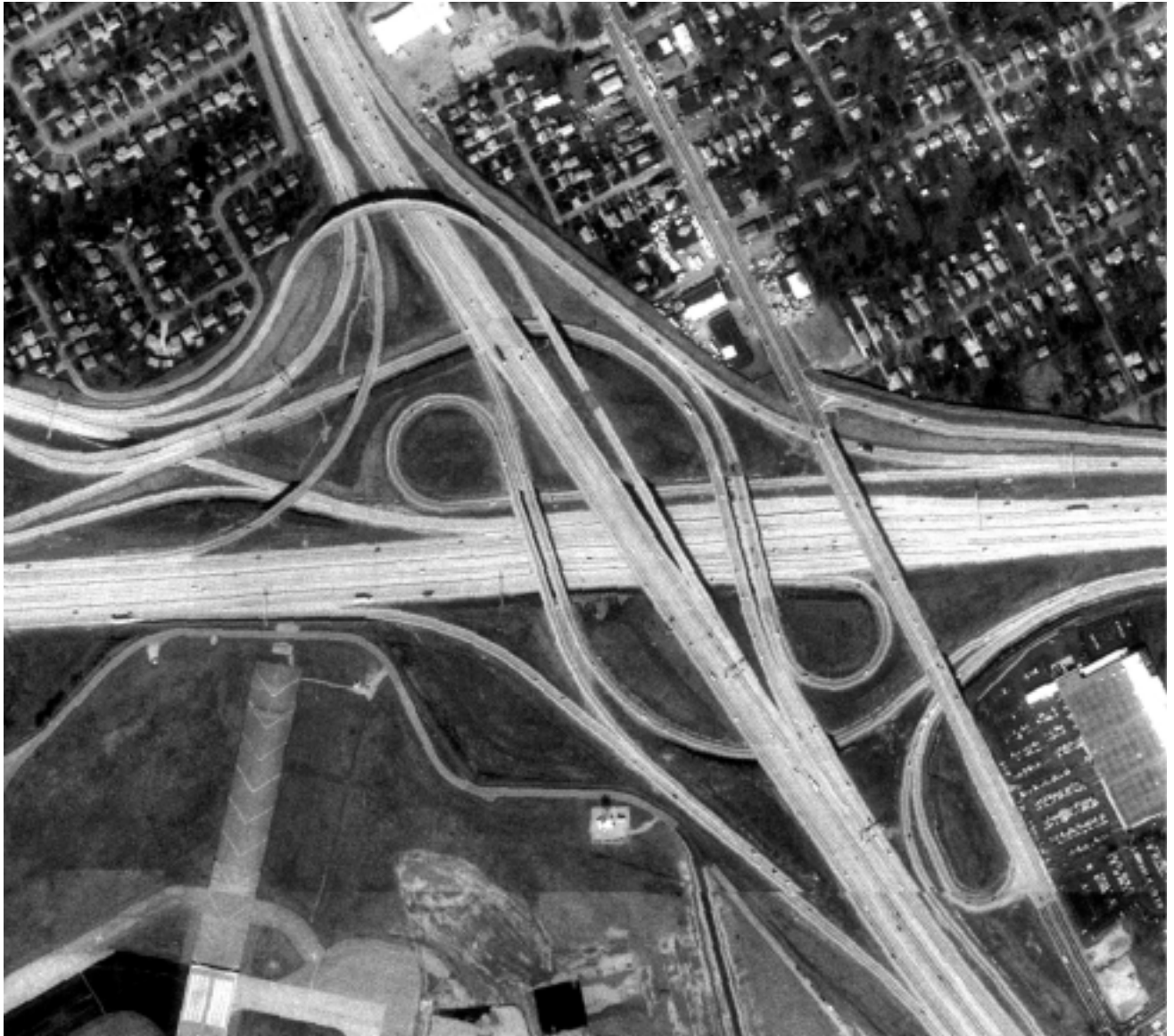
Figure 2: Example of the Challenges of Coding Ramp Information

Below is the system KYTC has developed to uniquely code each road segment within an interchange. ( See http://www.kytc.state.ky.us/planning/gisourky/images/pdf/gps/ramps.pdf for a visual example )